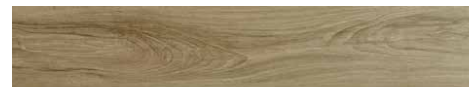
SAMOAN OAK 55511

*The colour and design of each product seen in this brochure may vary from the actual product. Please choose carefully from samples supplied in store.