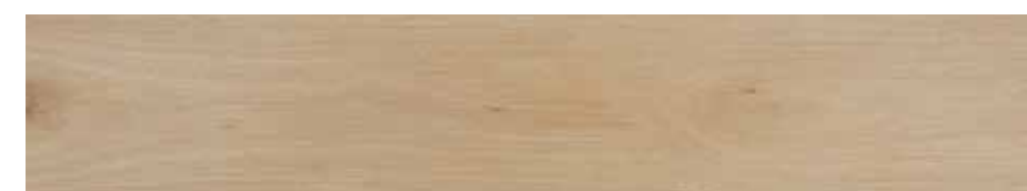
TASMANIAN OAK 55502