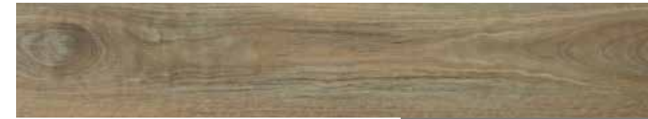
AUSTRALIAN SPOTTED GUM 55507