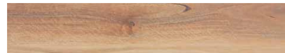
MOUNTAIN SPOTTED GUM 55508