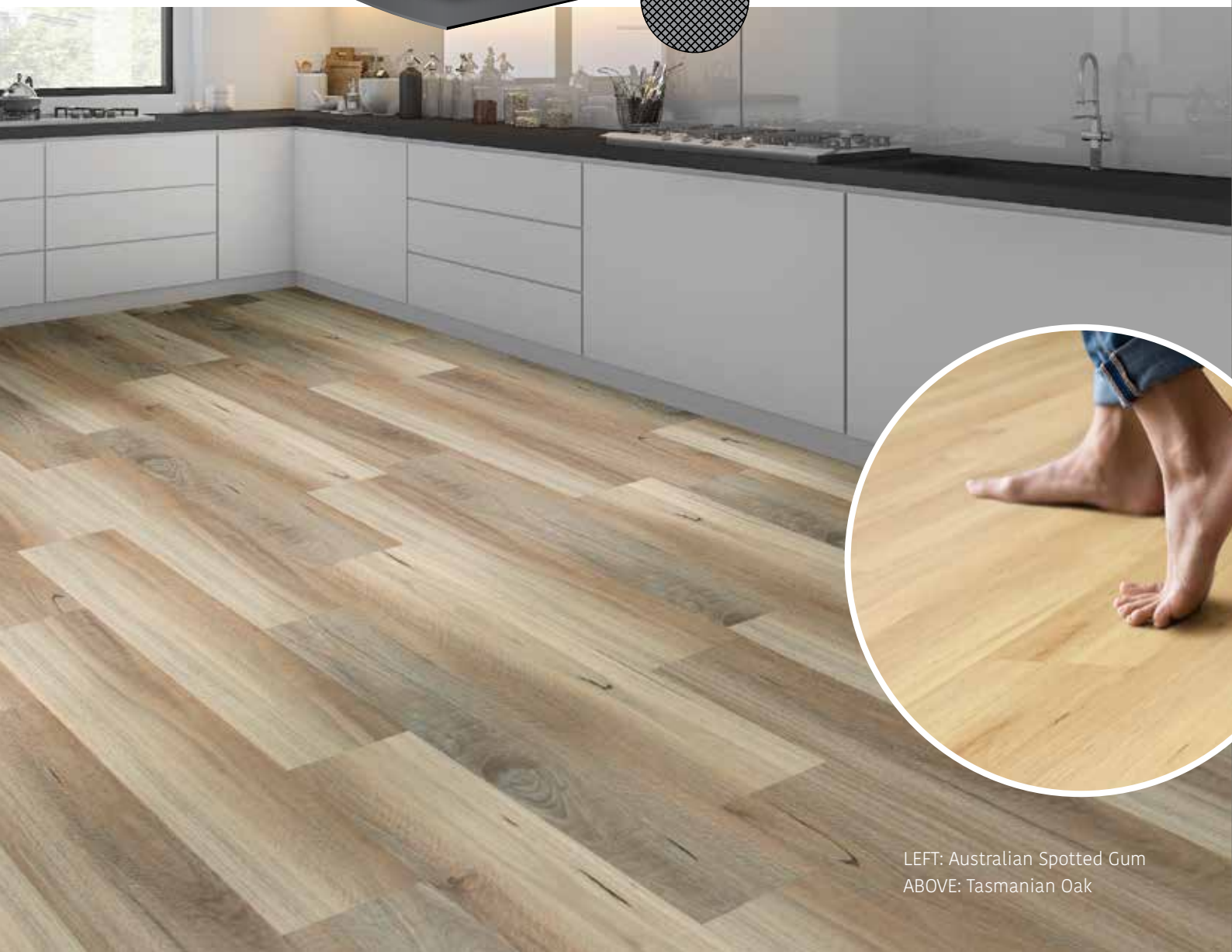
LEFT: Australian Spotted Gum ABOVE: Tasmanian Oak