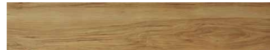
MURRAY RIVER BLACKBUTT 55501